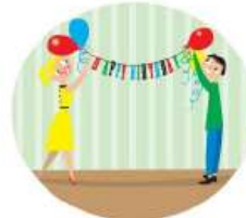
3. put up decorations