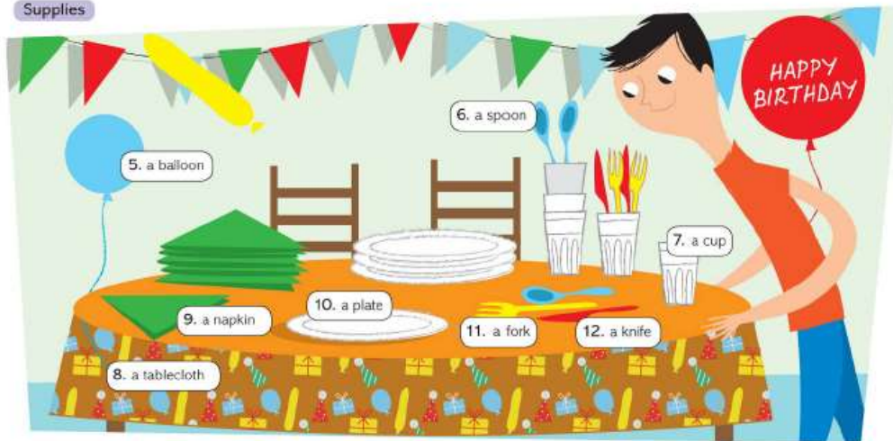
5. a balloon