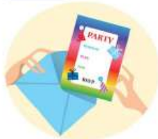
1. send out invitations