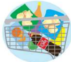
2. buy refreshments