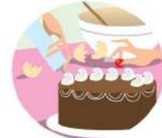
4. make a cake